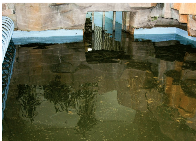
A Milwaukee zoo pool that went from clean to filthy in less than a day allowed Amanda Subalusky to measure nutrient content of hippo dung and urine.